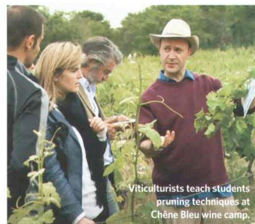
Viticulturists teach students pruning techniques at Chêne Bleu wine camp.